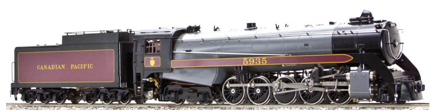
AL97-090 CP SELKIRK #5935