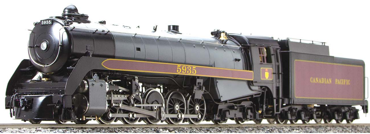
AL97-090 CP SELKIRK #5935

Accucraft's "Selkirk" #5935 represents the last T-1c class 2-10-4 built. Constructed by Montreal Locomotive Works in February/March 1949 as CP 5930-5935, these six oil burning T-1c class locos remained in service less than 10 years; the railway was already replacing steam with diesels. The 1:1 scale CP #5935 is preserved and on display at Exporail, the Canadian Railway Museum in Saint-Constant, Québec.